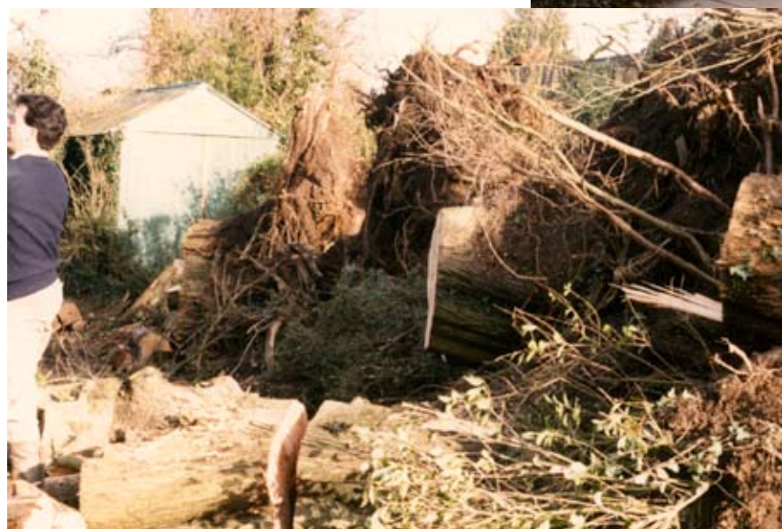
Four trees and the clearance at the Post Office - Christow - Rod Hancock - Postmaster

According to the Met Office the last storm of similar magnitude in England occurred in 1703.'