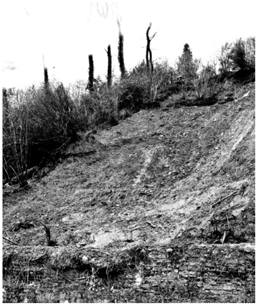
Second Landslip - Spring 2010 - Shane Edgar

In 1958 a landslide took place at the other end of the valley, at Culver. The main road to Moretonhampstead was closed for four days. It is, therefore, theoretically possible that landslips could happen again, simultaneously, at either end of the valley.